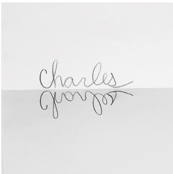
SHOW STEP 4