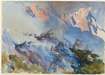
John Singer Sargent, Mountain Fire , 1906–1907. Opaque and translucent watercolor Special subscription, Brooklyn Museum.