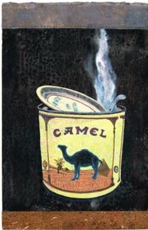
Kay Russell, Camel Can , 2013, Watercolor, Gouche, Thread, Watercolor Monotype Background