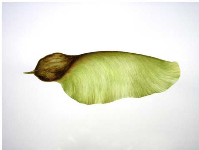
Parnell Corder, Maple Seed Pod , 2014, 30x22 inches, Watercolor on Paper, Private Collection