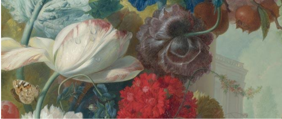
Detail from Jan van Os, Fruit and Flowers in a Terracotta Vase , 1777-8