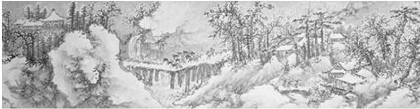
Xie Shichen. Winter Landscape , Ming dynasty (1368–1644). Gift of the Orientals.

http://www.britishmuseum.org/whats_on/exhibitions/light_time_legacy.aspx