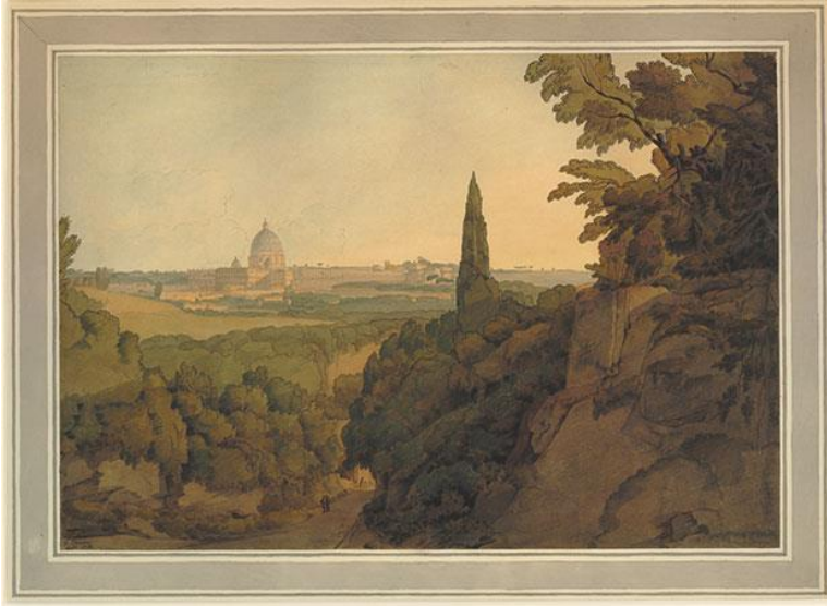
Francis Towne (1739-1816), St Peter's at sunset, from above the Arco Oscuro , 1781. Watercolour with pen and ink and gum arabic, 320 x 467 mm