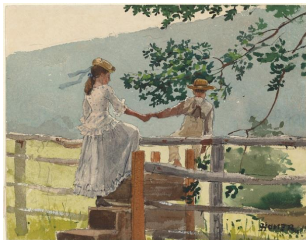
Winslow Homer, American, 1836 – 1910, On the Stile , 1878, watercolor and gouache over graphite. National Gallery of Art, Washington, Collection of Mr. and Mrs. Paul Mellon, 1994

Art, Washington, Collection of Mr. and Mrs. Paul Mellon, 1985