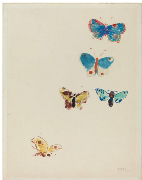
Odilon Redon, French, 1840 – 1916, A Flight of Butterflies , c. 1912, watercolor. National Gallery of

Further information: http://www.clevelandart.org/events/exhibitions/flowering-botanical-print